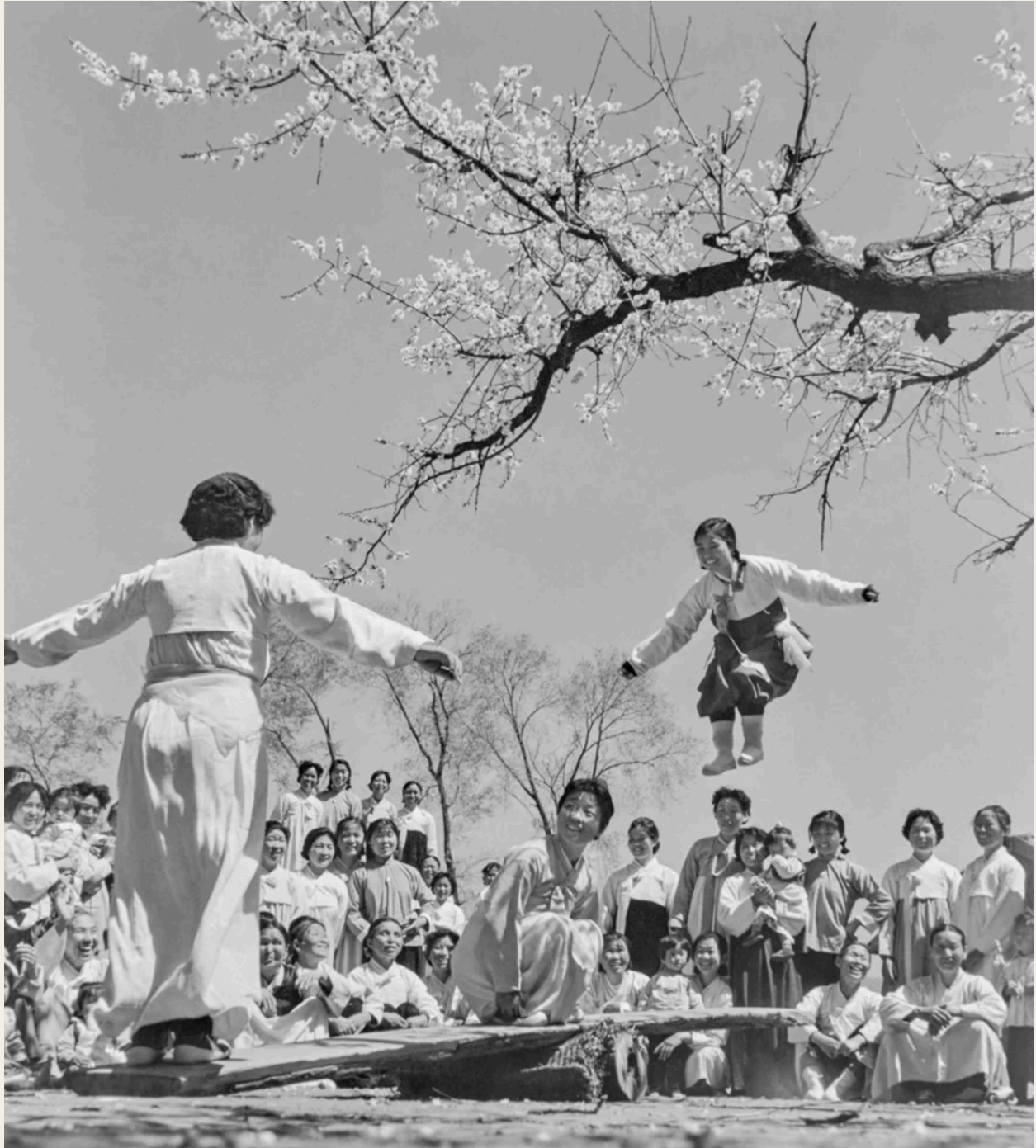
Young women skipping excitedly and joyfully, while flowers bloom on spring trees, reflect the beauty and romance of traditional Korean costumes. Women in traditional Korean costumes take part in a traditional skipping game on 31 May 1972 in Yanbian Korean Autonomous Prefecture, Jilin.