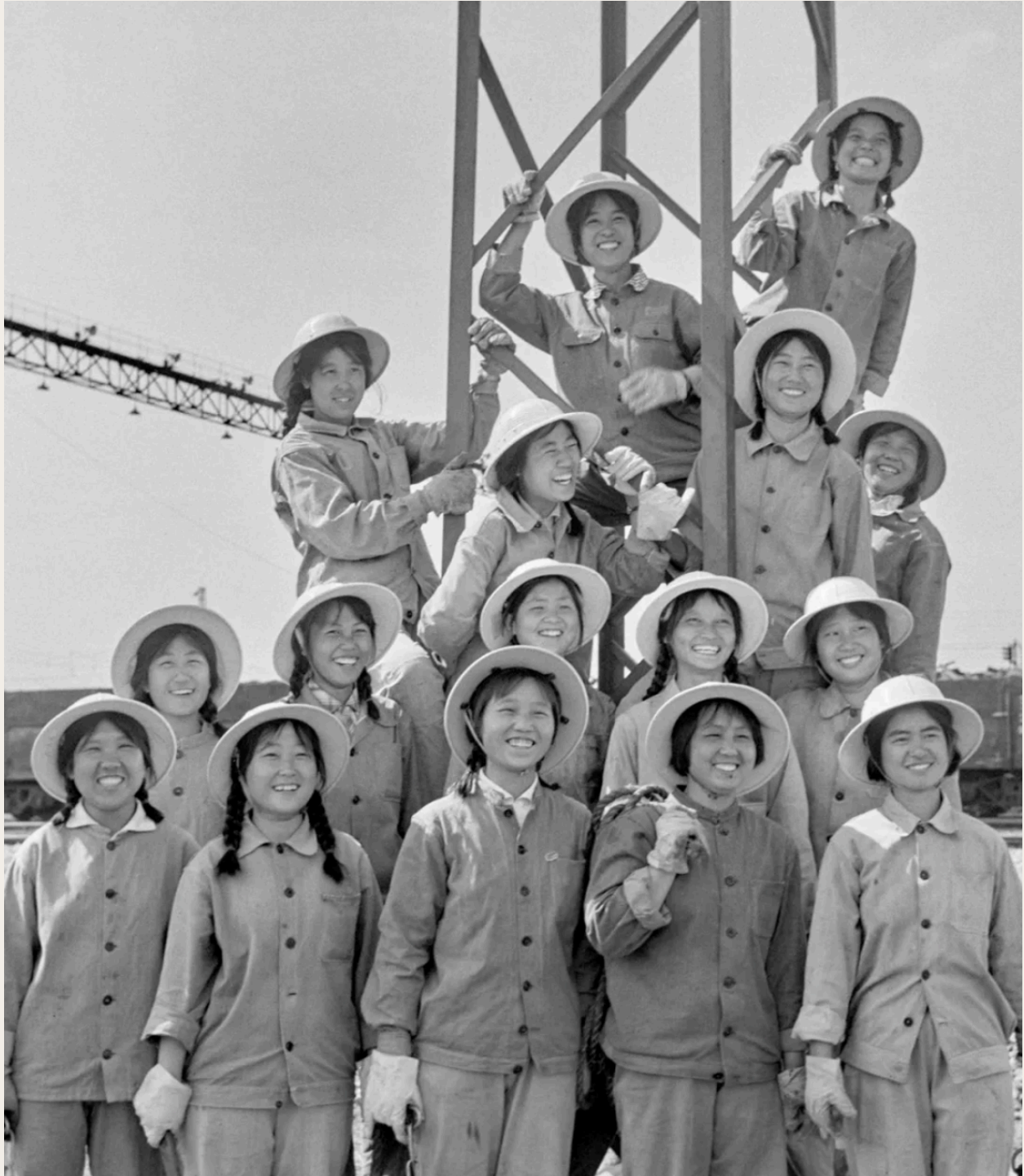
In July 1975, workers from the first division of the fourth team of the Electrochemical Engineering Department of the Electrochemical Engineering Bureau of the Ministry of Railways, taking part in the Baocheng Railway electrification construction project in Sichuan province.