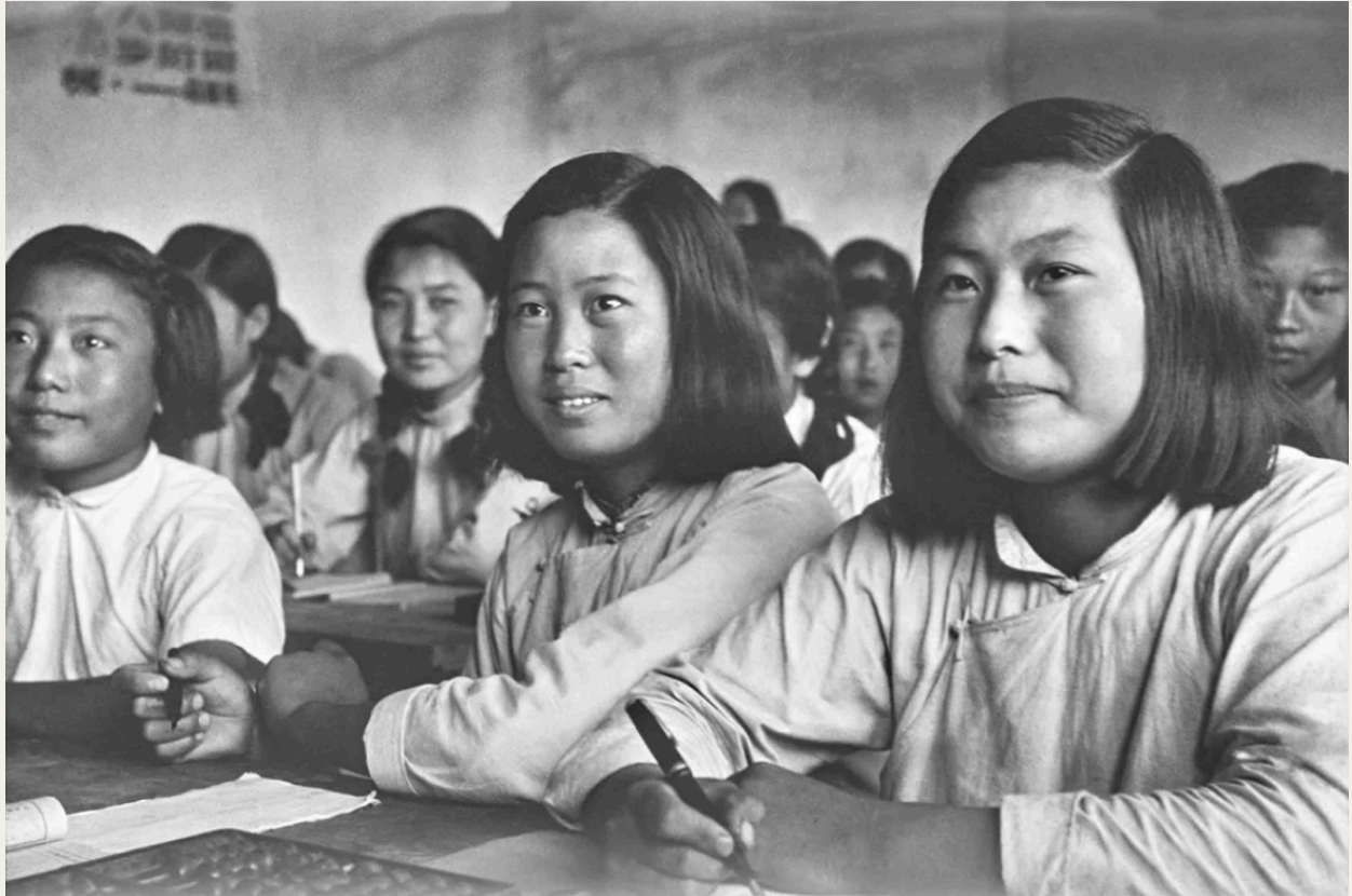
In July 1950, women from Luannan County, Tangshan, Hebei Province, learn about culture at the People's Cultural Center. In this decade, the loose cotton blouse was a common garment worn by women in rural China.