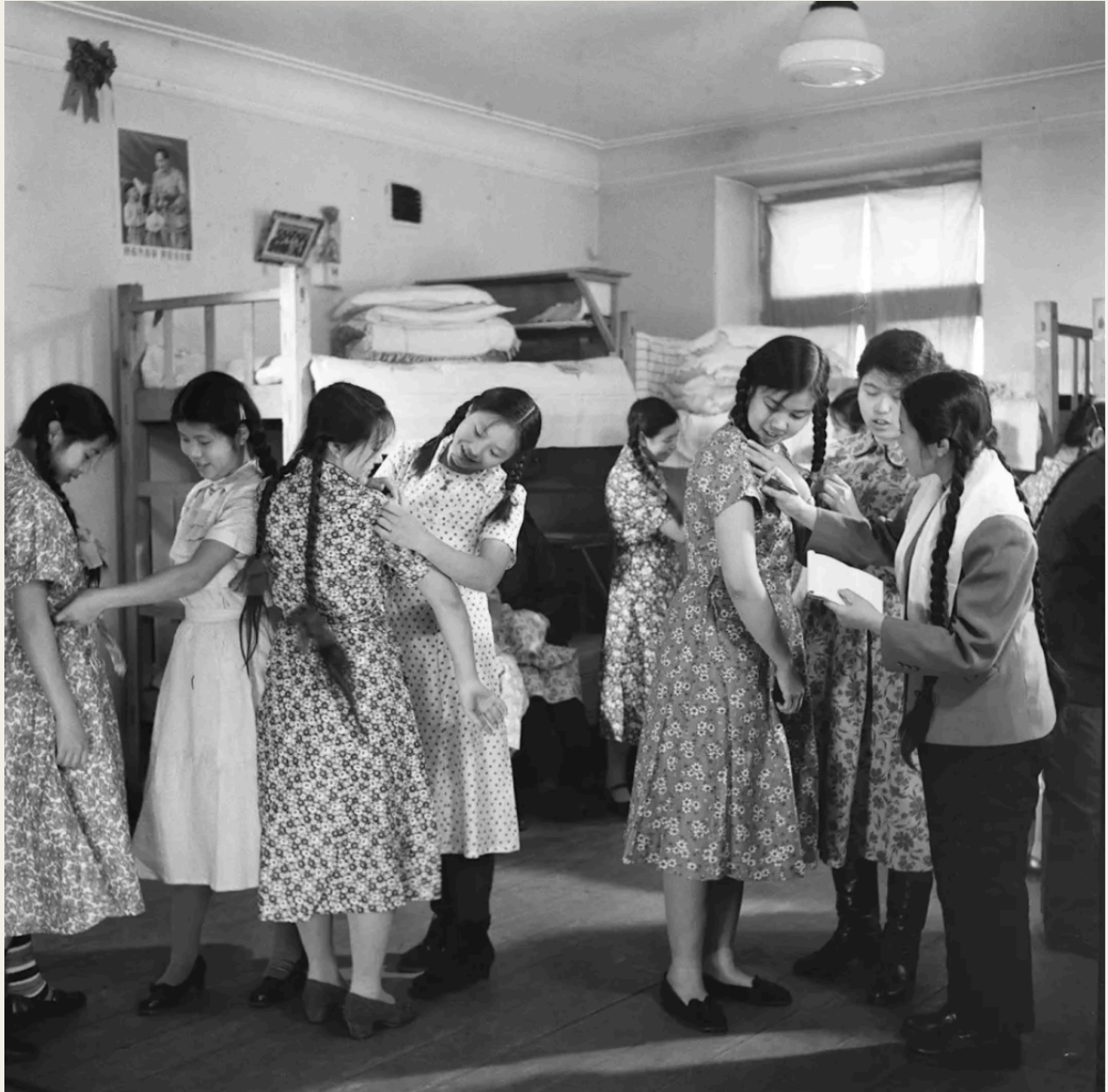
Young working women who love beauty experiment with clothes joyfully and enthusiastically. The same style, different patterns of “Braj”, like flowers blooming, the beauty of youth has blossomed. 1950s, Harbin, Heilongjiang, linen textile factory, female workers trying on “Braj”.