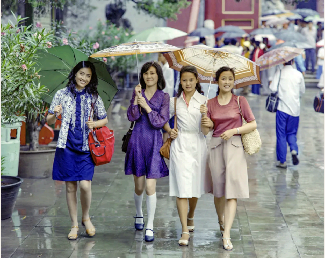
The rainy day was misty, the clothes were elegant, and the protagonist's youthful exuberance and self-confidence in fashion were rich in beauty, becoming a vivid footnote to the popular culture of the 1980s.