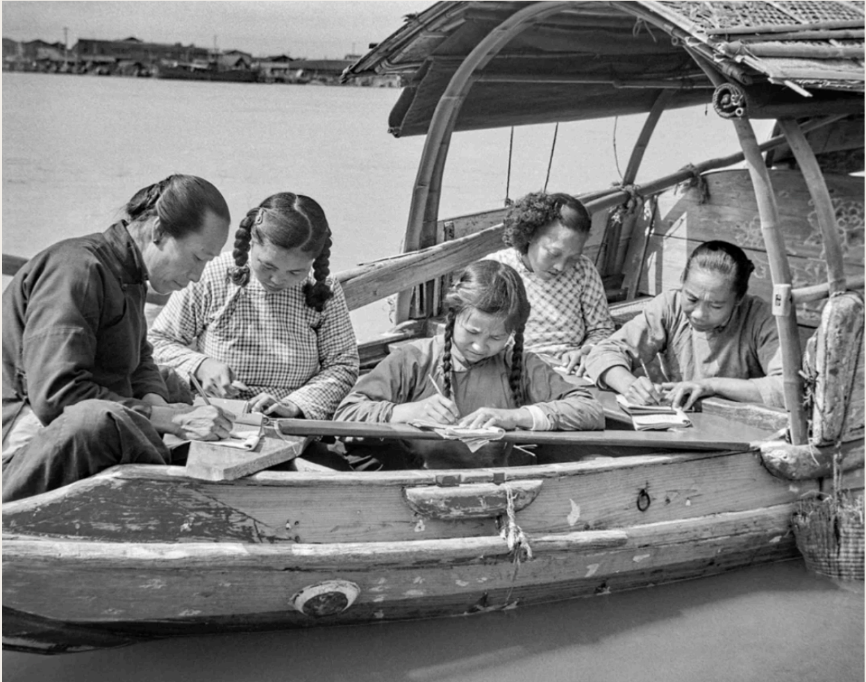
The image is rich in information, with women from different generations concentrated, and the setting of the “water study” adds more interest to the image. 1958, water residents in Fuzhou, Fujian province, who participated in the “literacy” program, practice writing.